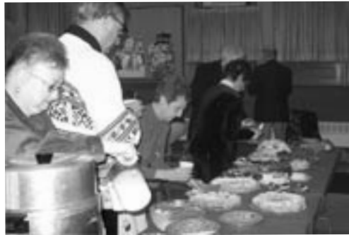
Guests line up to enjoy the fine selection of donated desserts.

The Society wishes to thank those members who have already paid their dues for 2006. Membership cards have been mailed.