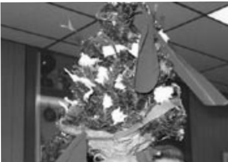
Winner of the best "decorated tree" went to Table #2

All others should have received your applications in a separate mailing. Your quick response to our annual membership drive will be greatly appreciated.