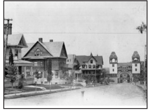
The Boulevard in Prohibition Park.

Anyone interested in further information about the group may contact the Society at wis_si@yahoo.com. ∞