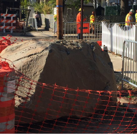
This huge boulder was unearthed during the street excavation.

Work on the Wardwell Avenue Project has entered the storm and sanitary sewer phase.