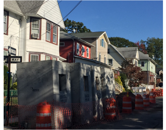
Construction work along Waters Avenue during the street excavation.

The contact person for the project (the Community